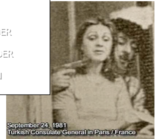
September 24, 1981 Turkish Consulate General in Paris / France

Woman held hostage by Armenian terrorists in Paris See more at ' http://tallarmeniantale.com/