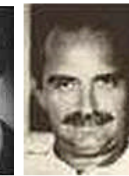
ENVER ERGÜN 19 November 1984 Vienna/Austria (Turkish Rep. to UN)