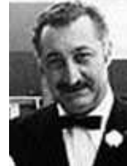
ORHAN GÜNDÜZ 5 May 1982 Boston/USA (Honorary Consul General)