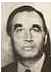
TAHA ÇARIM 9 June 1977 Rome/Italy (Vatican Ambassador)