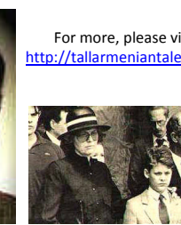
For more, please visit http://tallarmeniantale.com/